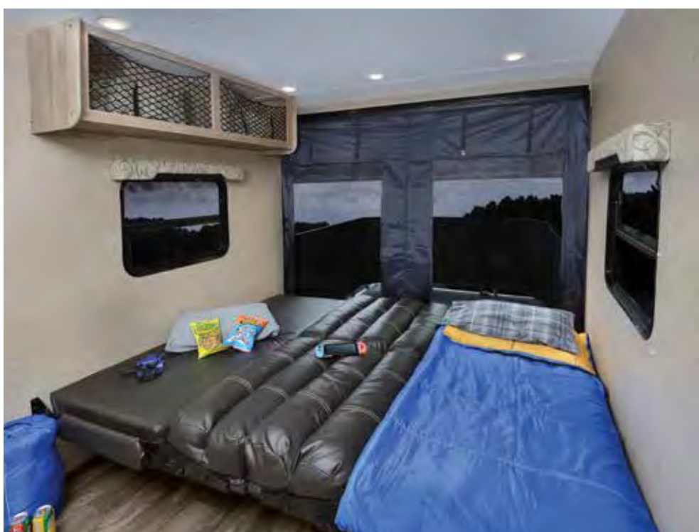
OPTIONAL PATIO KIT