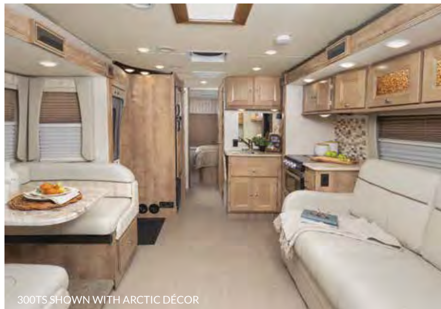
300TS SHOWN WITH ARCTIC DÉCOR

Actual towing capacity is dependent upon your particular loading and towing circumstances, which includes the GVWR, GAWR and GCWR as well as adequate trailer brakes. Please refer to the Operator's Manual of your vehicle for further towing information.