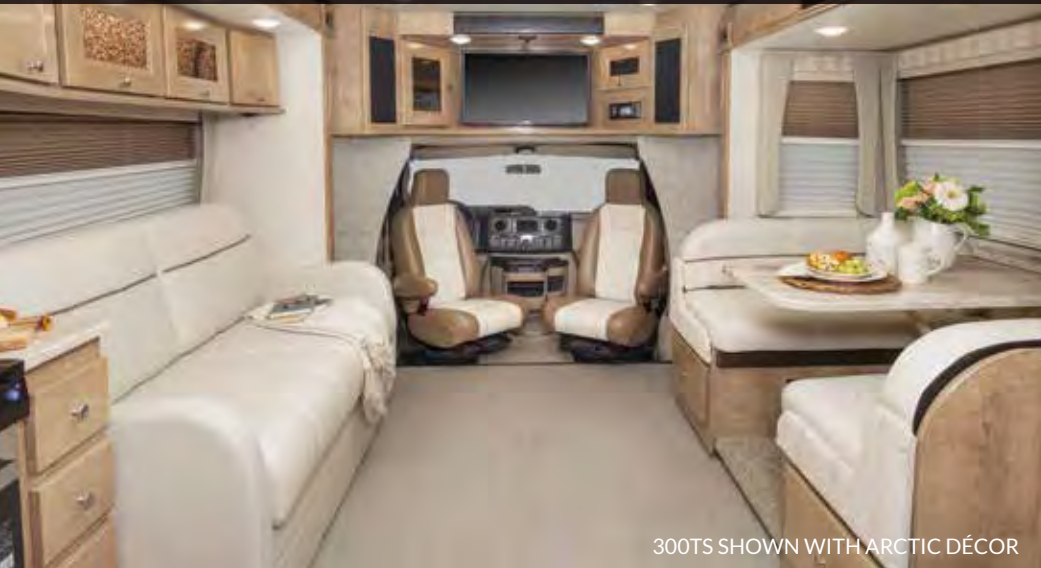
300TS SHOWN WITH ARCTIC DÉCOR