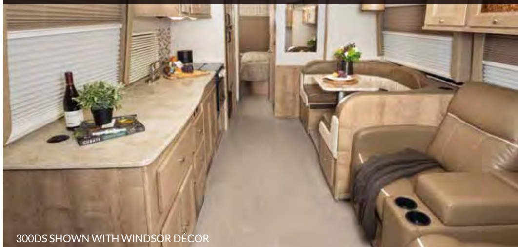
300DS SHOWN WITH WINDSOR DÉCOR

OPTIONAL PASSENGER & DRIVER SWIVEL SEATS