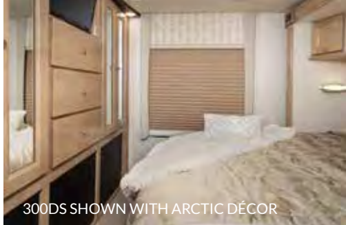
300DS SHOWN WITH ARCTIC DÉCOR