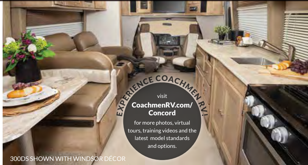
300DS SHOWN WITH WINDSOR DÉCOR

visit CoachmenRV.com/ Concord for more photos, virtual tours, training videos and the latest model standards and options.