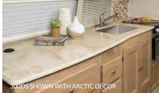
300DS SHOWN WITH ARCTIC DÉCOR