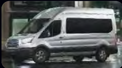
Ingot Silver exterior paint now available