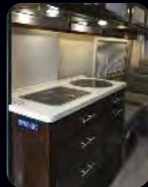
High Gloss Cherry cabinetry