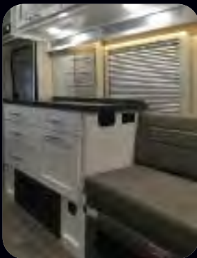
High Gloss White cabinetry

This versatile Class B motorhome is designed for today's active lifestyles. Experience unrivaled fuel economy combined with legendary Ford® styling and reliability. Relax in luxurious captains seats while enjoying the view through large frameless windows. The interior ergonomics ensure you are as comfortable on the road as you are at home. Crossfit gets you where the action is, in style!