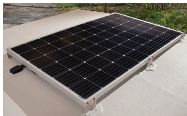
175 W Solar Panel and 30 Amp MPPT Control Charger – Optional on all models