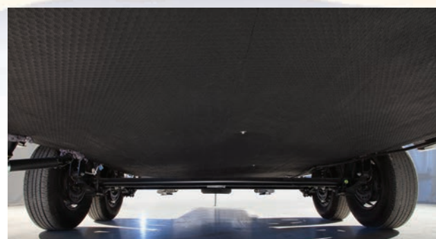
Heated and Enclosed Underbelly

Quick Connect Gas Griddle, Sidewall Mount Table and 24" x 48" Outdoor Table included on all Ultra Lite and Liberty/Maple Leaf travel trailers.