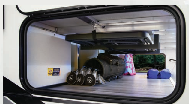
Fully Lighted Pass-thru Storage with a 24" x 48" outdoor resin table stored above. (Most floorplans)

This exclusive Utensil Drawer provides handy storage. Seamless Edge Countertops are standard on Freedom Express. Solid Surface Countertops are standard on Liberty and Maple Leaf. (Most floorplans)