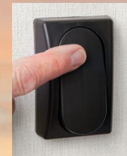
Large paddle light switches