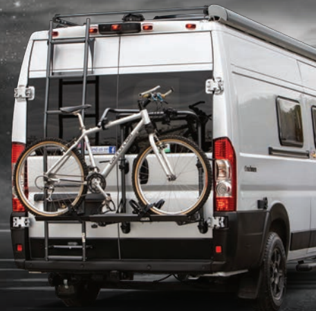
Optional bike rack