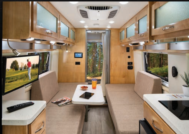
The versatile 20RB twin bed model has contemporary hardwood cabinetry and a spacious rear bath with a one-piece fiberglass shower. Nova's side windows open to increase ventilation.