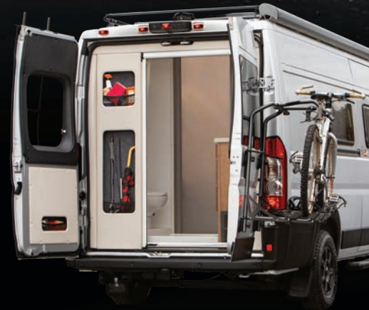
Easy to access rear bath and storage