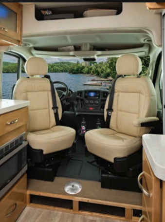
Swivel Captains chairs with removable table