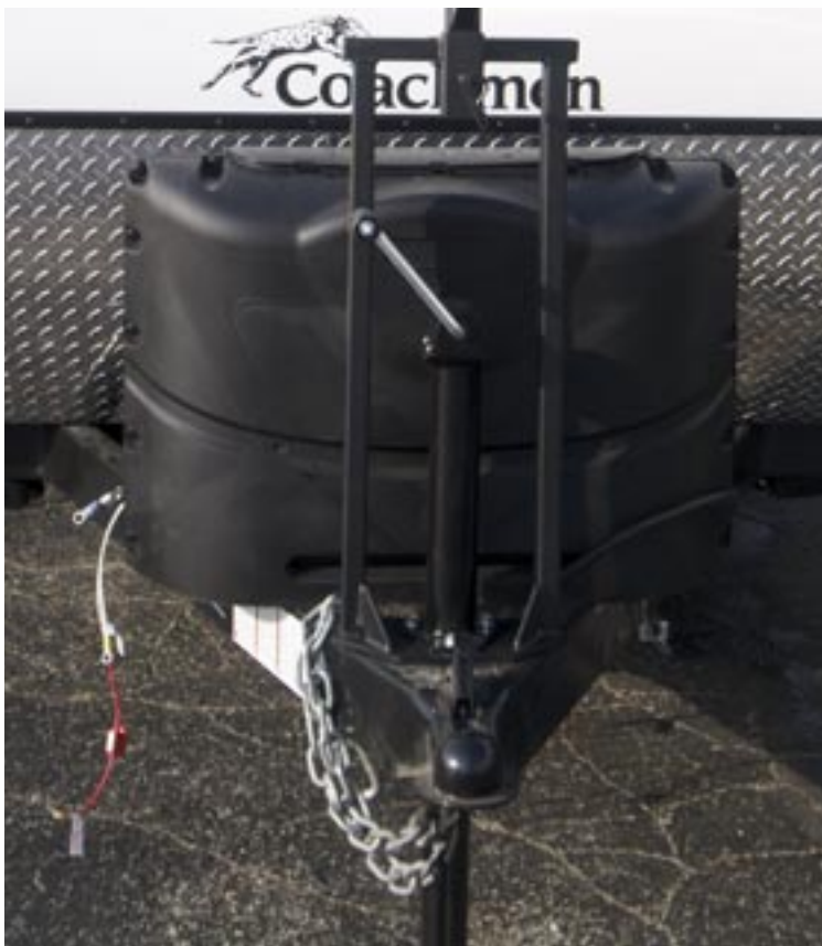
Dual LP Tank with Cover • (2) 20 lb. Tanks with Cover for Longer Camping Time