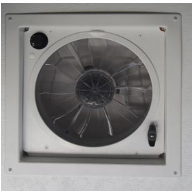
High Volume Power Roof Vent • Dometic Fan-Tastic Vent • 3-Speeds • Quiet Operation • 9.3 CFM Air Circulation