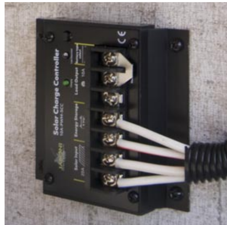
Jaboni 100 Watt Solar Panel with 10 AMP Control Charger to Battery