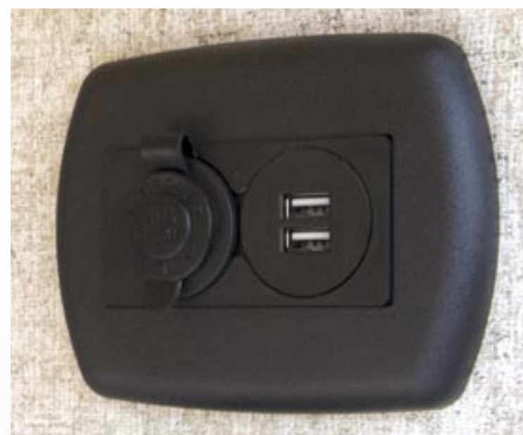
12 Volt Outlets (Pass-thru and Outside Kitchen)