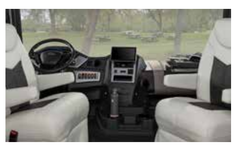
The Encore Class A Motorhome is spacious and stacked with amenities. From its tastefully appointed kitchen with stainless steel appliances, to the exterior LED TV, Encore has more features than ever before.