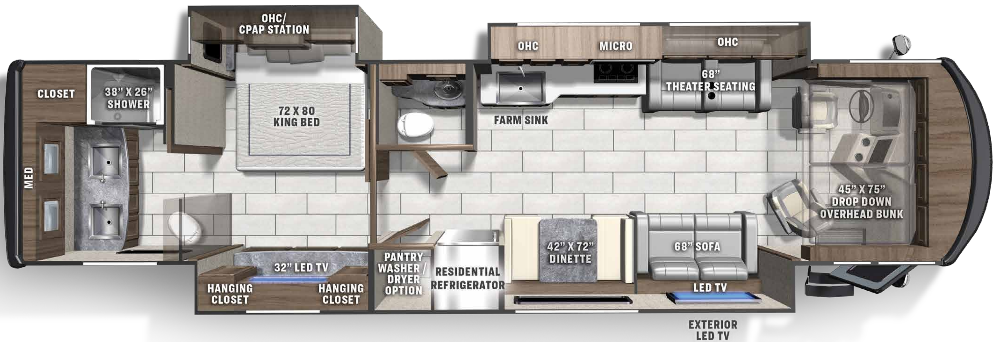
411TS COMING SOON