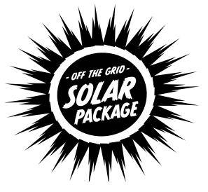
PACKAGE INCLUDES: • 200 WATT PANEL • 30 AMP DIGITAL SOLAR CONTROLLER