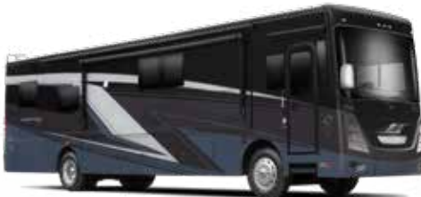
Full Body Paint - Crater Lake