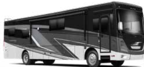
Full Body Paint - Joshua Tree