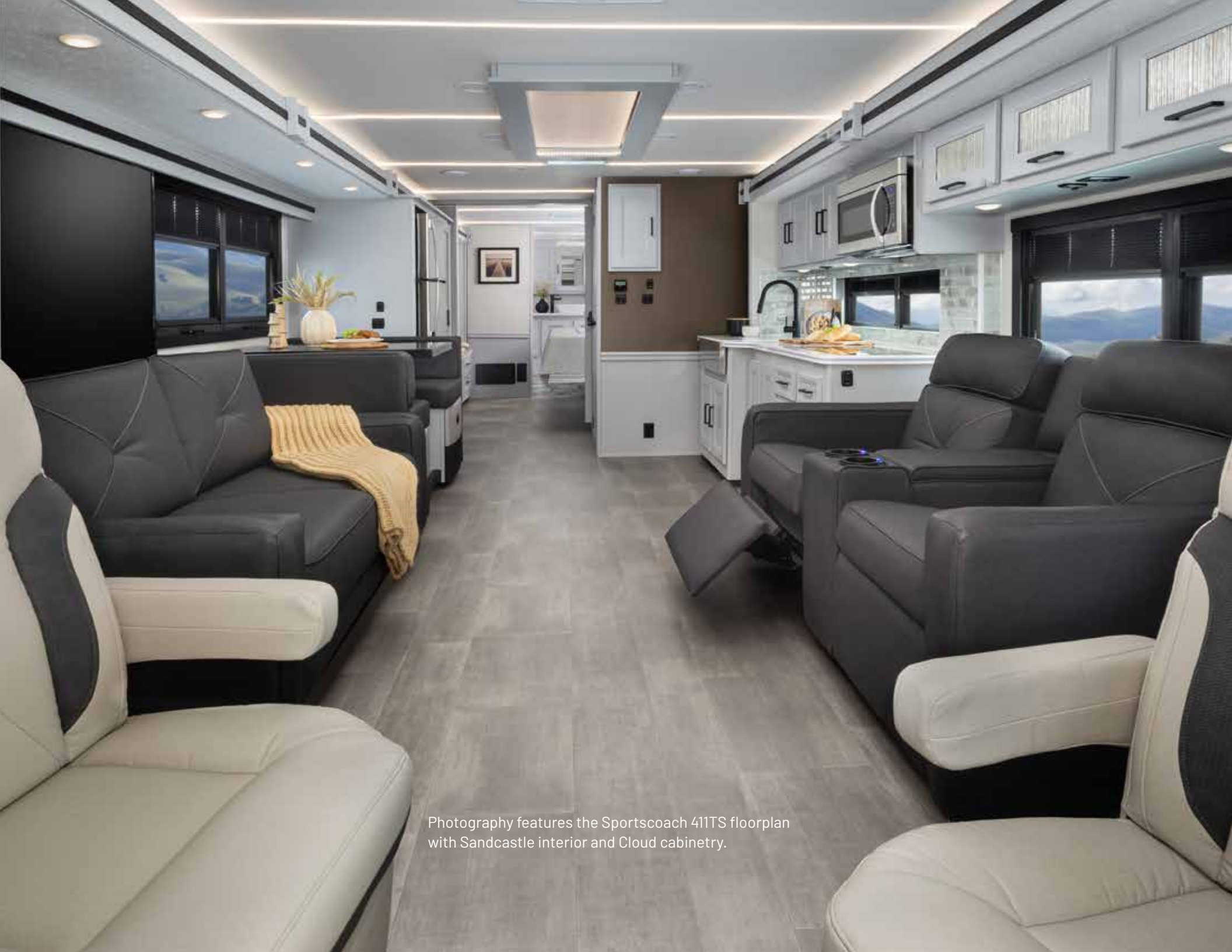
Photography features the Sportscoach 411TS floorplan with Sandcastle interior and Cloud cabinetry.