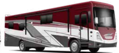
Full Body Paint - Redwood