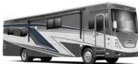
Full Body Paint - Glacier Bay